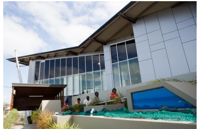
Visitors arrive at the refurbished Gab Titui Cultural Centre