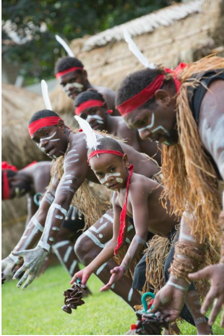
The Kaurareg Wabunaw Geth Dance Team performs for guests at the reopening